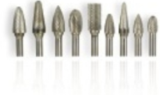
Cut carbide burs All types.