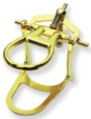
Articulators All Typs.