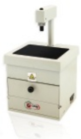
Laser pindrill Sting - 99.