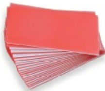
Modelling wax all types pack / 500g.