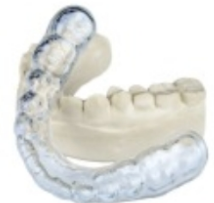
E.Gasket Nightguard pack / 12 pcs.