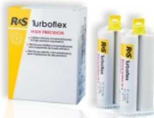
Turboflex is complete range of vinyl polysiloxane addition silicones Putty - light - Regular.