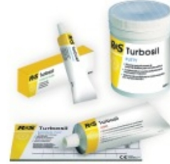
Turbofill kit / putty , Catalyst , light ,pads.