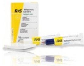
Temporary cement Eugenol-free zinc oxide based temporary cement kit / 40g.