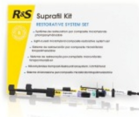
Suprafil - composite - all shades