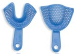
Impression Trays plastic - all types pack / 12 pcs.