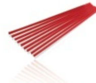
Priphery wax utility wax pack / 32 sticks.