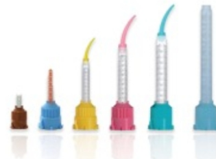
mixing tips All types pack / 50 pcs.