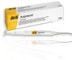
Supracal Calcium Hydroxide paste (45%) syringe / 2g.