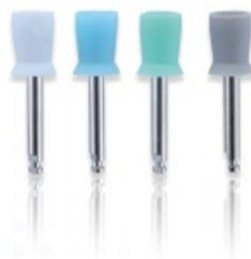
Prophy cup pack / 100 pcs.