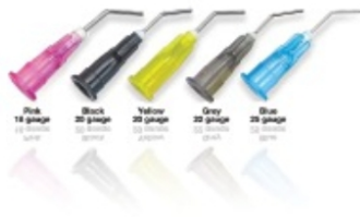
Disp.prebent needle SS&PP pack / 100 pcs.