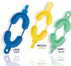
Fluoride tray size : S,M,L pack / 100 pcs.