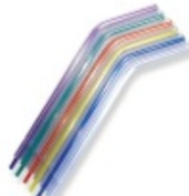
Air / water 3.way Tips plastic - 95mm pack / 250 pcs .