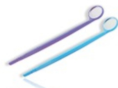
Dis . mouth mirror Assorted colour pack / 100 pcs.