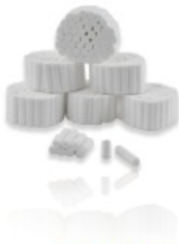
cotton rolls pack / 1000.