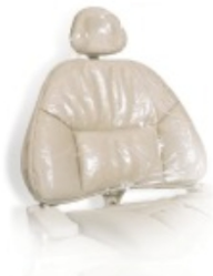
Half chair covers Available : full covers pack / 225 pcs.