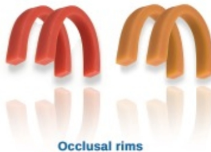
Occlusal rims U - shape , rods pack / 100 pcs.