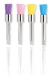
Prophy Brush pack / 100 pcs.