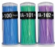
Micro Applicators Regular - fine - n.fine pack / 100 pcs .