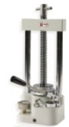
Hydraulic press pl.88.