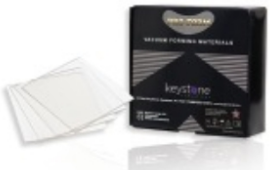
SOFT EVA bleaching tray pack / 25 pcs.