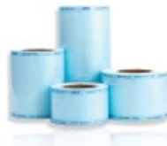
Sterilization pouch Roll / 200m.