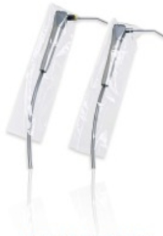
Syringe sleeve cover Size 2-1/2"x10" pack / 500 pcs.