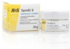
Temfil II Temporary filling material Jar / 30g.