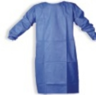
Surgical gown w / towel, warp size : S,M,L,XL.