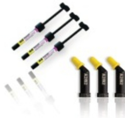
Nanofil self curing - nanohybrid Syringe / 4 g - capsules 0.25 g