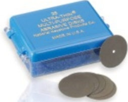
Ultra - thin - Disks pack / 25 pcs.