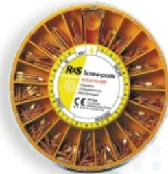
Screw - posts goldplated titanium stainless steel