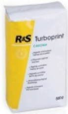
Turboprint - Alginate Fast set , ortho pack / 500 g.