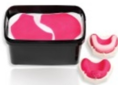
LC tray plates pink - blue pack / 50 pcs.