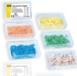
Wooden interdental wedges pack / 100