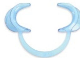
Cheek retractor All types Size : S,M,L.