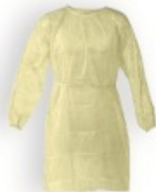
Disp. Isolation gown Yellow - green - blue - white 115x37 cm - box / 100 pcs.