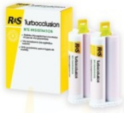
Turbocclusion Silicone bite registration material kit / 2X50ml + 12 tips