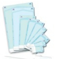
Sterilization pouch pack / 200 pcs.