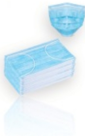
Non - woven face mask ear loop - tie on, 3ply pack / 50 pcs.