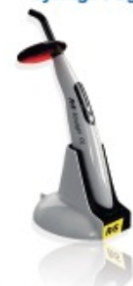
Easylight led lamp cordless high-power.