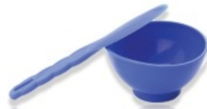
Mixing bowl size :S,M,L.