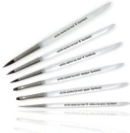
Kolinsky Brushes size : 0 - 8.