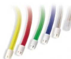
Salive Ejectors plastic - standard pack / 100 pcs.