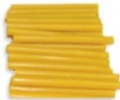
Sticky wax Adhesive wax pack / 10 sticks.