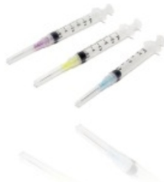
Disp.irrigation syringe W / needle pack / 100 pcs.