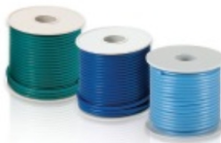
Spru wax All size Pack / 250 g.