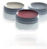
Crown wax - 65 g Cervical wax - 65g CAD / CAM WAX - 65 g.