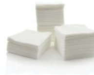
Cotton Gauze 8 ply - 2"x2" pack / 100 pcs.