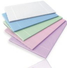
Dental Bib 3 ply - 13"x18" pack / 500 pcs.