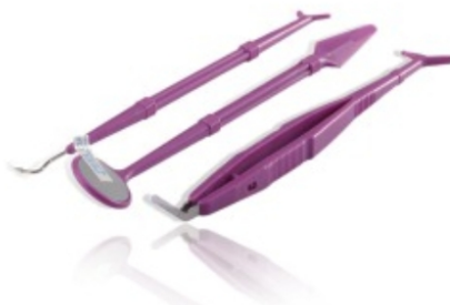
Dental kit set / 3 , set / 5.