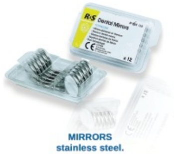
MIRRORS stainless steel. aluminium.