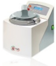
Polymerization unit Pl.17.