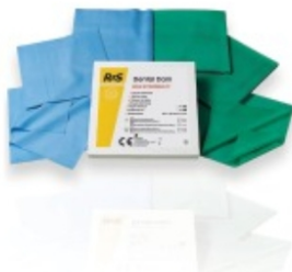
Rubber dams natural latex / 36 latex free / 20