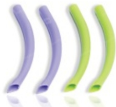
Evacuation tips Adult - child pack / 50 pcs.