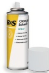
Orange solvent spray 200 ml.